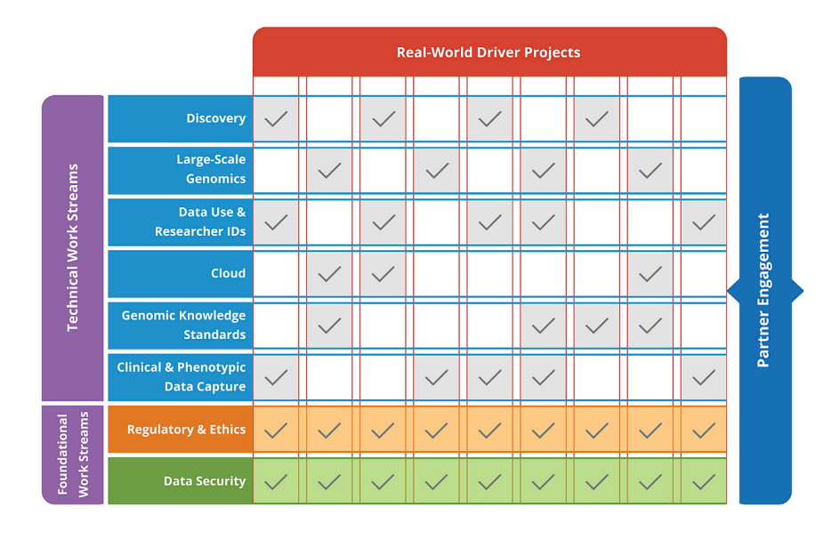
Figure 1. Matrix structure of the Global Alliance for Genomics and Health

GA4GH is a community of diverse stakeholders from Driver Projects and other institutions working together in the context of Work Streams. Each GA4GH Driver Project is expected to dedicate two full-time equivalents across at least two GA4GH Work Streams. As foundational groups that review all GA4GH deliverables, the Regulatory and Ethics and Data Security Work Streams must have representation from every Driver Project. In addition to Driver Projects, any member of the community-regardless of domain, sector, nation, or affiliation-is invited to participate in any GA4GH Work Stream. Supplemental information includes details on how each of the 24 GA4GH Driver Projects intersects with the six technical Work Streams