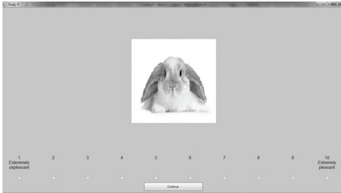
Figure 2. Image rating task 1 (pre-rating task) 1

After the 17th trial (12th nonintentional precognition trial), the program administered a second image rating task that was contingent upon participants' tacit precognition scores. This task was identical to the initial image rating task, but this time with 10 images being selected from the remaining unrated images of the five aforementioned subsets. Participants who scored four hits or more ( MCE = 3 ) were rewarded by being able to rate images from amongst their three most preferred subsets, whereas participants who scored three hits or fewer were negatively rewarded by being asked to rate images from their three least preferred subsets. The exact composition of images for the final task was determined according to the criteria specified in Table 1.